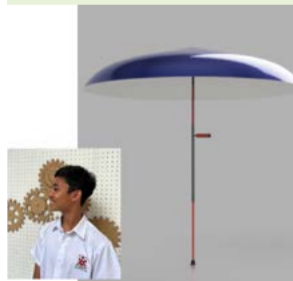
ADJUSTABLE WALKING STICK AND UMBRELLA