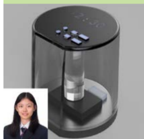
ALARM CLOCK FOR HEARING IMPAIRED